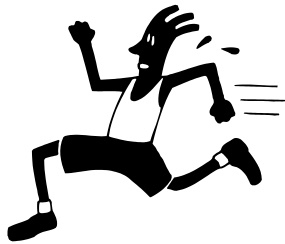
= Energy Out

Below are websites with Calorie Calculators to help you find your personal caloric needs for each day: